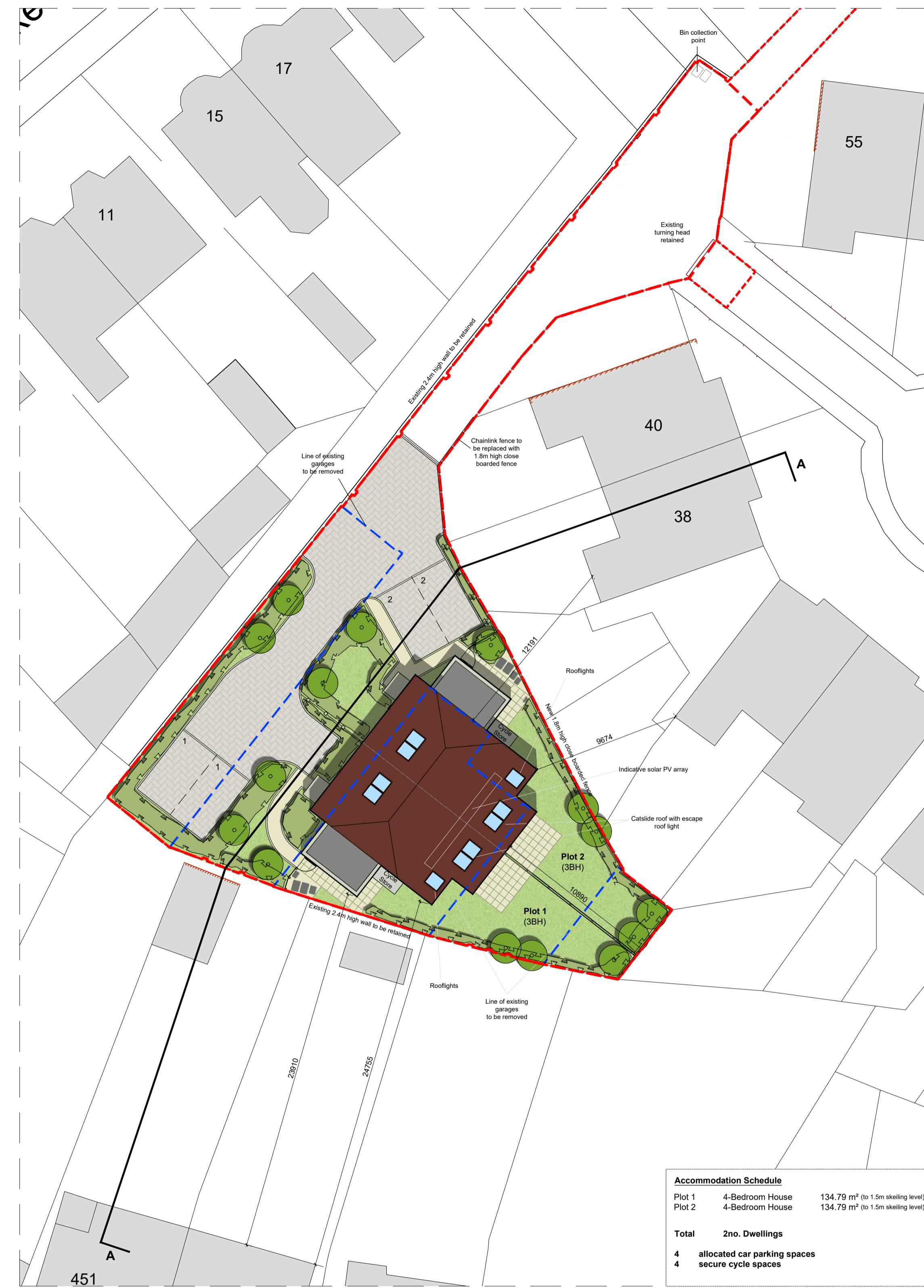
Proposed Site Layout